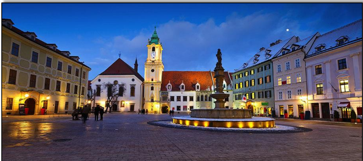
View of Bratislava, Slovak Republic.

Workshop participants will be invited to discuss the legal aspects of compensating victims having suffered nuclear damage due to a nuclear incident occurring at a nuclear installation, which has transboundary damage. Even though experts from the public and private sectors will be invited to speak on the different topics addressed in the programme, the workshop should leave enough time for all the participants to contribute to the discussion, to encourage a real exchange of experience and point of views.