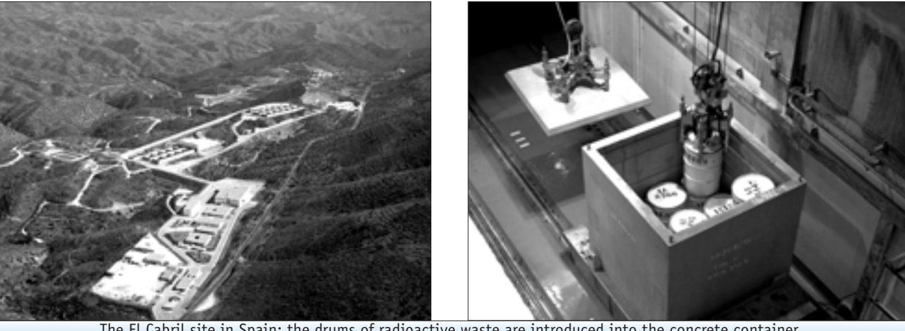
The El Cabril site in Spain: the drums of radioactive waste are introduced into the concrete container before being disposed of into the repository vaults.

of which in practically all countries in which activities relating to nuclear energy are carried out, standards have been developed to guarantee the health of the general public, the workers involved and the environment. Likewise, institutions specifically responsible for nuclear and radioactive issues have been set up, and have been provided with human and material resources as well as the necessary legal authority to ensure high levels of safety control.