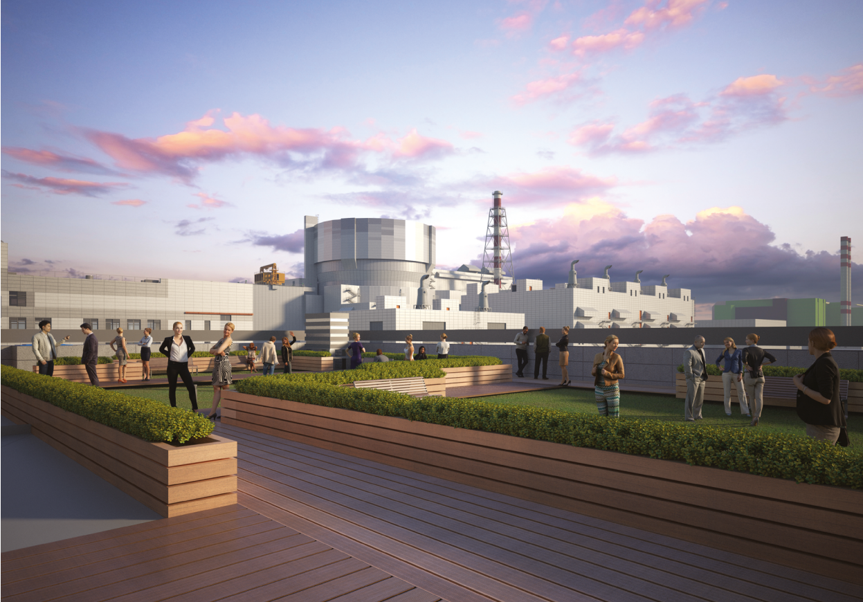
Figure 5.1: 3D model of Paks-II Nuclear Power Plant

two VVER-1200 units at Xudapu Nuclear Power Plant are under construction, with First Concrete dates of 28 July 2021 and 19 May 2022, respectively. In Hungary, a VVER-1200 unit 5 is under construction at Paks Nuclear Power Plant, and the Construction License Application for unit 6 is under review.