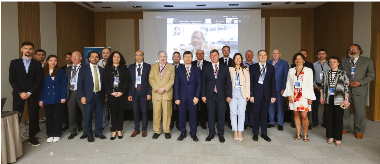
Figure 5.2: LW-SMMR brainstorming workshop participants

The safety issues associated with LW-SMMRs were widely identified during these discussions and will serve as crucial inputs for defining the prioritised topics of MDEP. Currently, the LW-SMMR working group programme plan is under development, building upon the outcomes of the workshop.