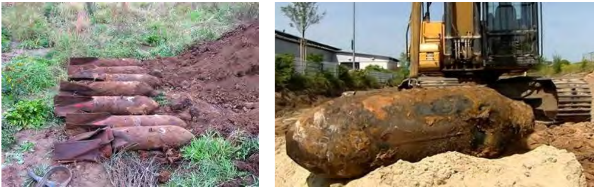
Figure 5.3.1: Typical findings of bombs and unexploded dud shot from the Second World War in Germany, left finds from Köthen (Saxony-Anhalt), right from Nuremberg (Bavaria)

Comments: This finding is of importance for the RK&M project. It shows that military conflicts can indeed lead to complete loss of knowledge regarding dangerous goods, weapons or archives. But once lost knowledge can only be restored with great effort and only to a limited extent again. With increasing temporal distance to the events (in this case, the Second World War), the additional problem of finding witnesses and the lack of documentation is found in an intensified form.