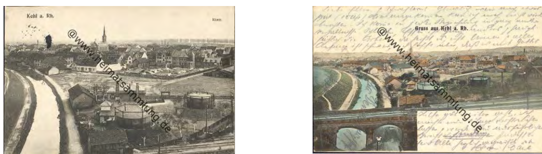
Figure 5.2-1 Postcards of the area of the old gas factory in Kehl with two gas tanks, on the left of the two photos: the now backfilled channel

The gas works and tar oil production facility were originally located on a channel, the so called "Schuttermühlkanal" (see Figure 5.2-1). This channel was considered by the health authorities of the city as a source of diseases such as malaria and was backfilled after the Second World War. The terrain was subsequently further transformed (mounding, earth depositing, new streets, modified buildings etc.). Site plans and building designations of the old gasworks had only limited value for the localization of soil pollution and the tar pits. The historical exploration of the contaminated site in the archives of the respective offices was therefore largely inconclusive for a long time. Only an extension of the search to the Hanauer city museum founded in 1956, which primarily kept records of the native and ethnographic history of the city, led the experts on the right track.