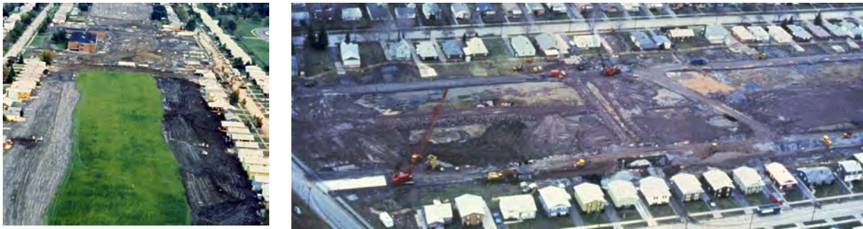
Figure 5.4.1: Some images of Love Canal during and after the clean-up

Comments: The case of Love Canal points to another aspect, which is of importance for the RK&M project. Besides well-known factors such as lack of or improper storage cadastre or sparse to non-existent documentation, the case of Love Canal points to other key features that show how information can be lost.