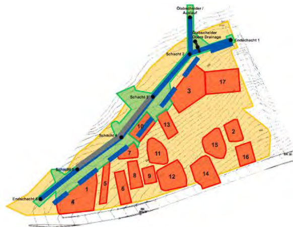
Figure 5.1-7: Landfill for acid resin of Tössegg, Wildberg, Switzerland. Location of the disposal 1 to 17 filled by more than 8'000 200l-drums with PCB-containing acid resins (according Geotechnisches Institut o.J., nach http://www.geo-online.com/portrait/referenzen.cfm )

First pollutions of groundwater beneath the landfill had already been detected in the 1980s. The first imposed clean-up work focused on the collection of the toxic seepage with drainage lines, initially near-surface drainage, later a second deeper drainage line. In 1989, the Canton of Zurich was still assuming that no further controls on groundwater or interventions in the landfill would be necessary and that the eluates from the landfill were within the law. However, recurring small tar seepages finally led to further investigations in 1994. The enlisted experts assessed different needs for clean-up measures, and the responsible cantonal environmental office decided to leave the matter alone and ordered no further measures. The cantonal authorities seem to have wanted actively to forget the case.