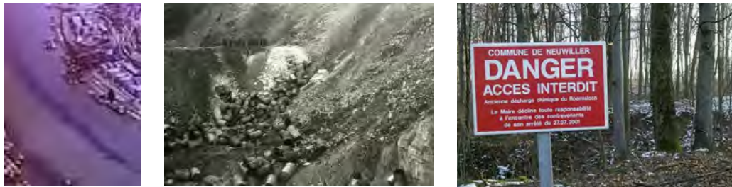
Figure 5.1-4: Some pictures on waste handling of the Basel Chemical Industry. To the left: discharge in the Rhine (1965); in the middle: the Feldreben-dump in an old gravel pit in Muttentz near Basel (1955); to the right: the dump of Roemisloch in Neuwiller, Alsace (2011)

Basel, partly also on German and French territory near the border (Grenzach FRG, Le Letten Hagenthal le Bas F, Roemisloch-Neuwiller F, Feldreben Muttentz CH etc., see Figure 5.1-4). Although protests were heard in some communities because of recurring pollution, the Basel chemical industry responded evasively for decades. The affected communities did not have enough weight to prevail against the powerful companies of the Basel chemical industry. The cleanup of the old sites got under way only gradually in recent years, after environmental groups and experts began to step in.