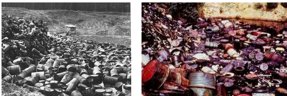
Figure 5.1-3: Some pictures of the waste dump for chemical wastes deposited between 1961 and 1975 in a clay pit near the village of Bonfol, Jura, Switzerland

On 7 July 2010, during excavation near the edges of the waste disposal site, an explosion occurred. Fortunately it caused no human injury but it stopped the clean-up-operation for over 1 year. The explosion was attributed to chlorates, which had been ignited by a spark from the excavator shovel. This event highlights two aspects: First, this incident confirms the limited knowledge about the disposed wastes and their subsequent chemical reactions. Secondly, it also documents the gaps in knowledge regarding the geometry of the landfill, which, despite later studies during the historical site assessment (e.g. evaluation of aerial shots), could not be detected with the required accuracy.