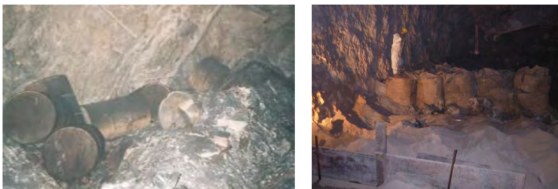
Figure 5.1-1: Some pictures of the waste inventory inside the galleries of the chalk mine of St-Ursanne, archive of the DMS-project of the Canton of Jura (on the left are some of the thousands empty or filled drums dumped into the mine between 1970 and 1993, and on the right: big-bags with galvanic waste emplaced in 1995)

The bankruptcy office in charge opened the archives, and the cantonal environment agency was brought in to assess the documents. It rated the technical documents of the factory as insufficiently valuable to warrant further archiving. All technical reports were thus destroyed. In consequence, valuable knowledge about the infrastructure of the factory was lost, and needed, so far as possible, to be restored at great expense.