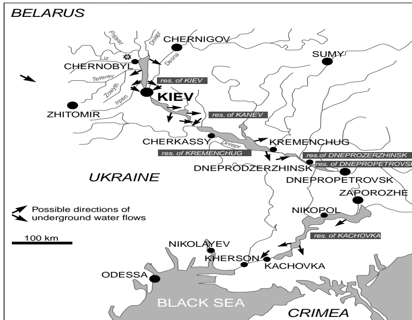
Figure 7. Possible groundwater flow directions in the Dniepr basin ^{137}\text{Cs} and ^{90}\text{Sr} concentrations in Bq/L-1, in the reservoirs of Kiev, Kremenchug and Kakhovka. Black area represent activities entering in the reservoirs, white areas activities leaving reservoirs (From Po01)